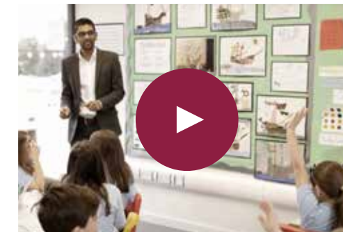
Video: Master of Arts in Education — China

In this Mandarin-language program, students can earn a master's degree in education completely online in as few as 16 months. They'll gain a broad perspective of current educational practices and challenges, along with a deeper understanding of essential educator skills, such as effective communication, collaboration, leadership, advocacy and innovation. Students in the Mandarin-language program take coursework in two high-demand focal areas: early childhood education and global education. MLFTC also offers the program in English, which features additional focal areas like advanced analytics, educating multilingual learners, learning design and technologies and more.